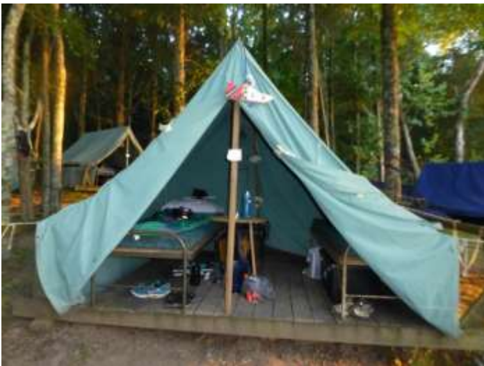
Platform Tent with cots

TROOP PICTURES: You will need to wear a complete field uniform to camp. A Troop photo is taken during arrival on Sunday. The Troop will be able to order a copy of the photo from the photographer.