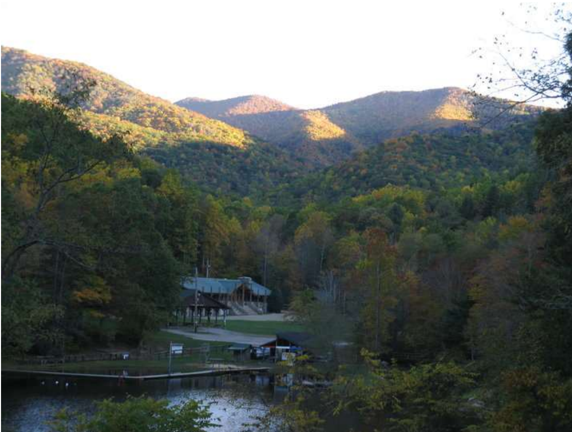
Lake / Waterfront